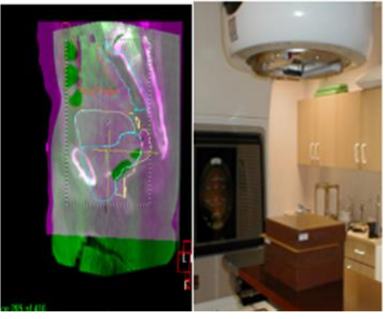
Image Guided & Adaptive Radiotherapy in Clinical Practice Thursday 15th to Saturday 17th May 2025